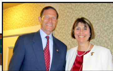
May 13-14, 2011 Convention Pictures